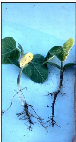
VITALYZE 3-0-0 IN-FURROW APPLIED