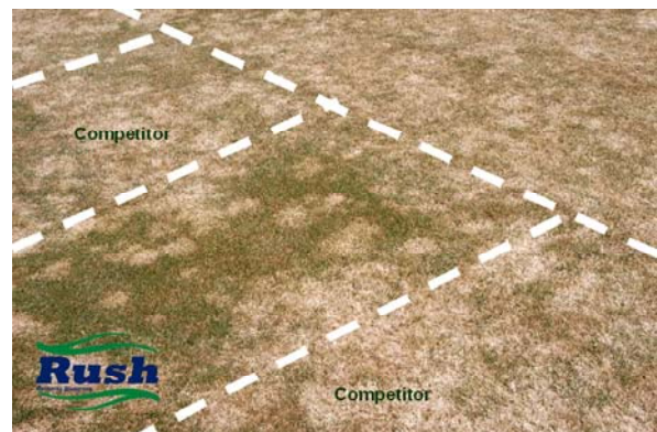
Winter survival of RUSH compared to competitors