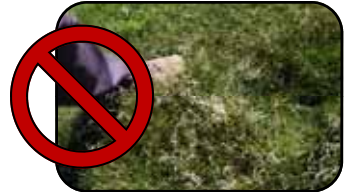
Too Many Seedheads