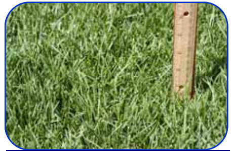
Beautiful turf that requires less mowing, My Holiday Lawn™

When My Holiday Lawn™ is mowed, the leaf growth is only partially removed, keeping your lawn looking fresh and green. Not brown and stemmy like ordinary