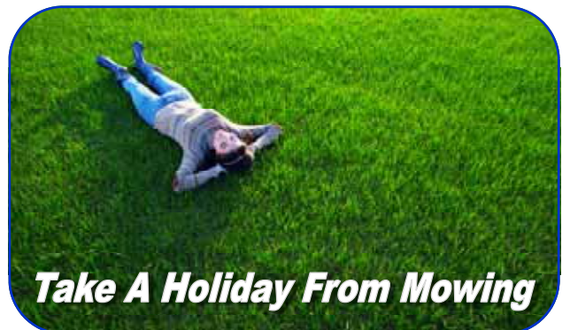
Take A Holiday From Mowing

Don't be the last one to go on a mowing holiday, contact your Jacklin distributor now or fill out the contact form at My Holiday Lawn.com.