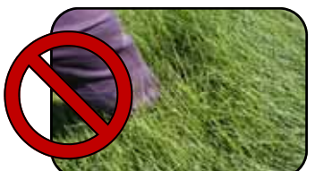
Too Much Top Growth