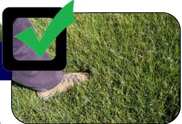
Just Right—My Holiday Lawn, shown here without mowing for one month

Jacklin Seed by Simplot is excited to introduce My Holiday Lawn™, a Kentucky bluegrass that can be mowed as little as ONCE A MONTH, as opposed to the 1 or 2 mows PER WEEK current normal lawngrasses require.