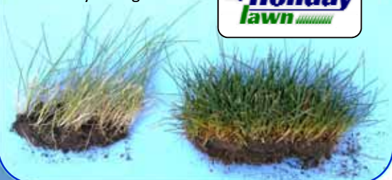
See the My Holiday Lawn™ difference! Ordinary lawngrass versus My Holiday Lawn™ with monthly mowing