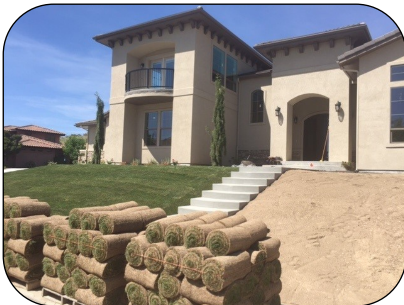
My Holiday Lawn sod being installed

We conducted a field plot study at our research farm to determine whether fine fescue could be mixed with My Holiday Lawn, since fine fescue is a shorter growing grass than its tall cousin. Results found that even at small percentages, fine fescue substantially dragged down the turf quality of My Holiday Lawn while it generated more leaf growth and needed more frequent mowing.