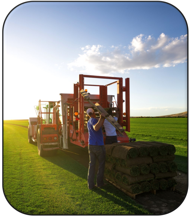
My Holiday Lawn sod being harvested

For more information, contact your Jacklin representative.