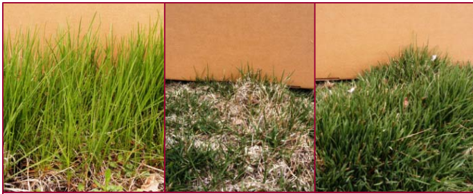
April 15, 2008 shows three patterns of spring greenup among bluegrasses. A common-type variety (left) is already a foot tall, while an improved variety (Midnight, center) is slow to wake up. '4-Season' (right), a new variety from Jacklin Seed, is already green and growing, yet with little topgrowth.

After the quirky winter we had, lawn greenup in many areas of North America was erratic or delayed. Low soil temperature is usually the most obvious culprit in sluggish spring greenup. Grass blades just won't grow until soil temps get over 40°F. And no amount of fertilizer at that point can help.